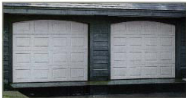
RHT 780 COLONIAL PANEL