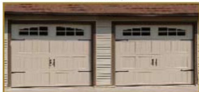
Pictures shown with optional strap hinges. Black hand forged handles are standard.