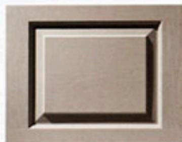
| Raised Panel