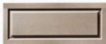
| Long Panel